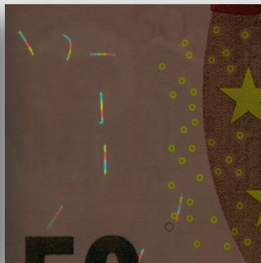
UV-light excites fluorescent ink and fiber