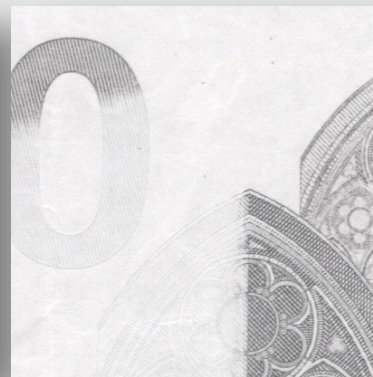
IR-light proves banknote's IR response