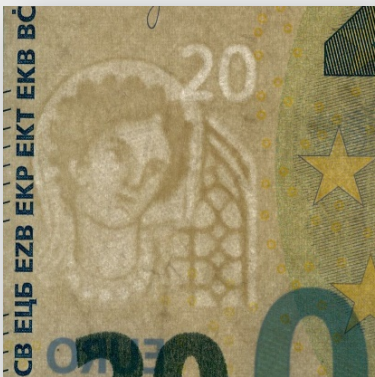
Backlight shows watermarks