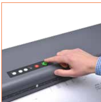
Flexible control panel for easy handling

Scan and document all your architectural, engineering and construction plans in standard file formats directly into your project folders.