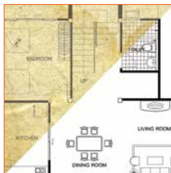
Improve your originals