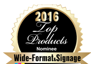
SD One nominated