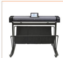
Low stand for side-by-side