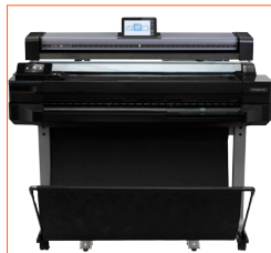
Optional high stand to place over printer.