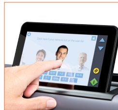
Browse user profiles on the SD One MF and scan direct to preset destinations unique to each user.