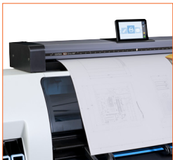
SD One MF is light enough to be placed on any flat surface like a printer.